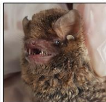
Miniopterus pallidus from Divrash2 cave