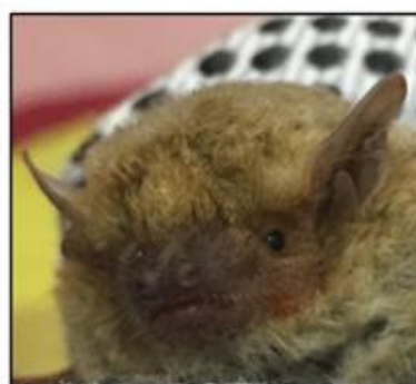
Pipistrellus kuhlii from Anzali beach