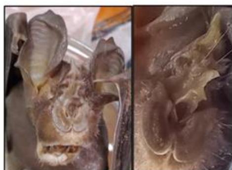
Corpse of Rhinolophus ferrumequinum from Shalash cave