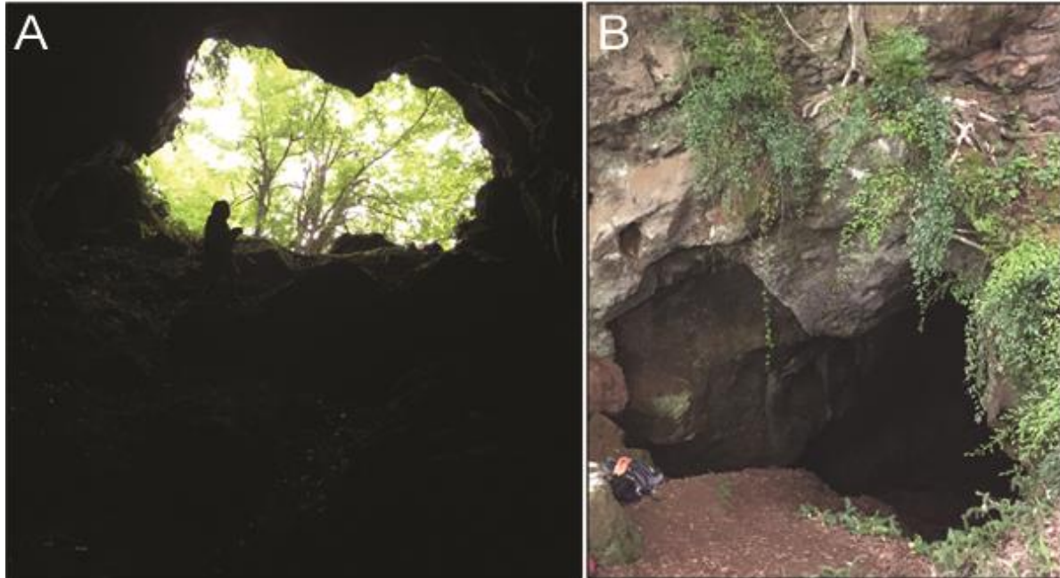
FIGURE 5. A) The entrance of Shoupar-Chal from inside the cave; B) The entrance from outside.

The third cave that we assign it as Divrash 3, is located on the outer walls of the Divrash 1, approximately 20 meters above its entrance (Figure 4-1). Two cavities are located above a steep slope next to each other, with the right one being a dead-end. The left cavity is a 10-meter narrow passage that leads to a small room. In this room, a population of 50 horseshoe bats occupied the low ceiling. At the right corner of the room, there is a fairly narrow passage that slopes down sharply to the undiscovered part of the cave that is coated with sticky mud. The connectivity between this passage and Divrash 1 needs to be examined. Several flying bats were also observed in this passage.