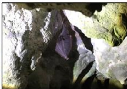
Rhinolophus hipposideros from Liyarud cave