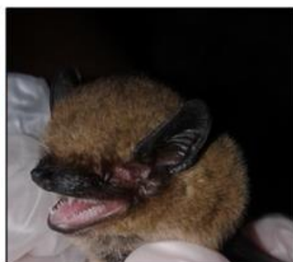
Pipistrellus pipistrellus from Darband Rashi cave