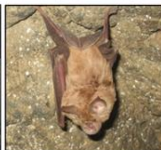
Rhinolophus sp. from Eqbal cave