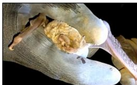
Miniopterus pallidus from Shoupar-Chal cave