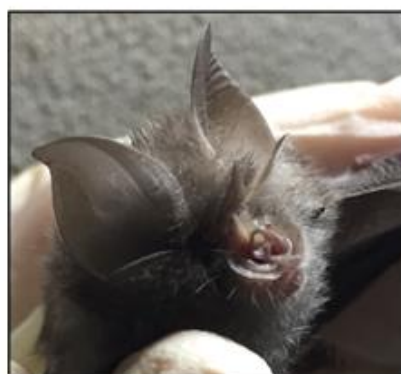
Rhinolophus hipposideros from Divrash2 cave