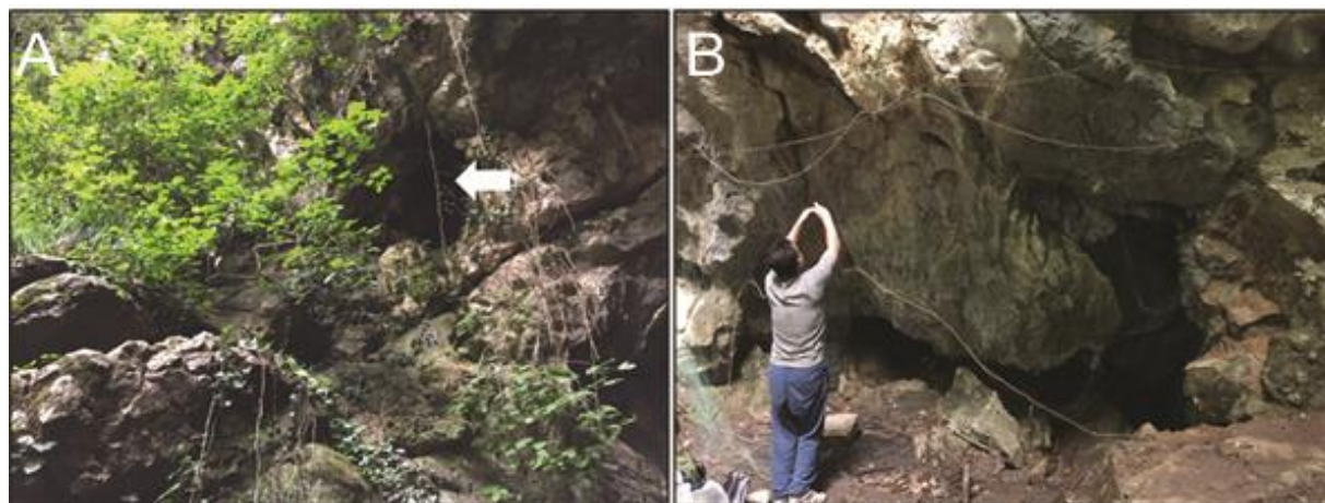
FIGURE 4. A) The entrance of Divrash 3 (white arrow); B) Installing mist-net at the entrance of Divrash 2.