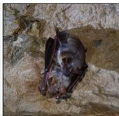
Myotis blythii from Cheshmeh- bad cave