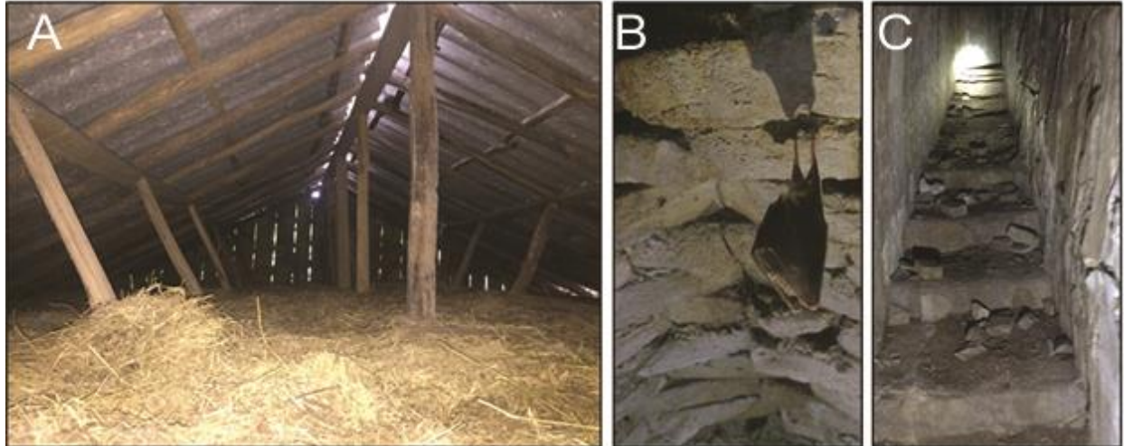
FIGURE 2. A) The roof of the barn in Lisar, roost of the lesser horseshoe bat; B) Unidentified horseshoe bat in the underground tunnel near Emamzadeh-Hashem; C) the passage of the tunnel.

Divrash 2 cave is a permanent and all-year-round roost for R. hipposideros . We observed less than ten immotile individuals hanging separately from the ceiling and walls of the cave near the floor during mid-autumn and early spring visits. During the mid-summer visit, one specimen was collected by a mist-net set up at the cave entrance as it emerged in the evening. Another individual was collected from a small cavity along the valley near Divrash complex caves during the mid-autumn visit. Shoupar-Chal cave, located in a small relict forest in the middle of a tea farm, was observed to have a big mixed colony of about 500 individuals of Miniopterus pallidus and R. hipposideros during the mid-summer visit. One flying individual of the lesser horseshoe bat was collected by a hand net. During the early spring visit, only a few flying bats were observed. Liyarud cave, located on a steep slope with dense forest coverage, was observed to have two individuals hanging from the low ceiling of the cave. These observations provide valuable insights into the distribution and roosting behavior of the lesser horseshoe bat in the western parts of Hyrcanian Forests, highlighting the importance of monitoring and studying bat populations in this area.