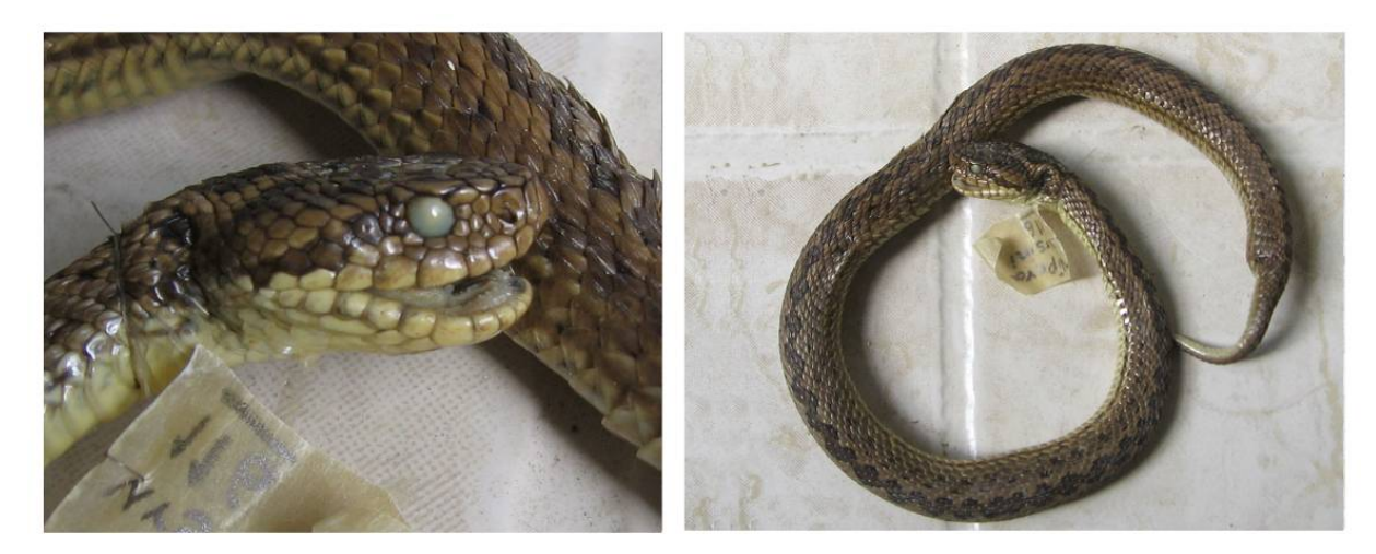
FIGURE 3. Vipera (Acridophaga) ebneri collected from Susahab village in the western Alborz Mountains.