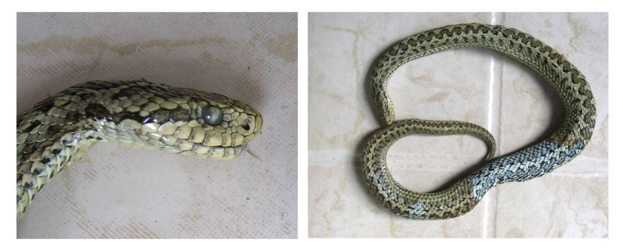
FIGURE 2. Vipera (Acridophaga) eriwanensis collected from the eastern slope of Sabalan Mountain