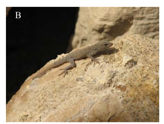
FIG. 2- A. Stone wall of a palm-grove, the natural habitat of Pristurus rupestris in 'Demaghah-I-Gora', northwest Varavi town, Lamerd region, in south of Fars Province. B, a specimen of Pristurus rupestris on the surface of a stone wall of same palm-grove.