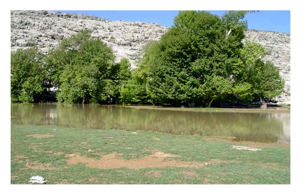
FIG. 2. - Ghadamgah spring – stream in Fars province (spring season).