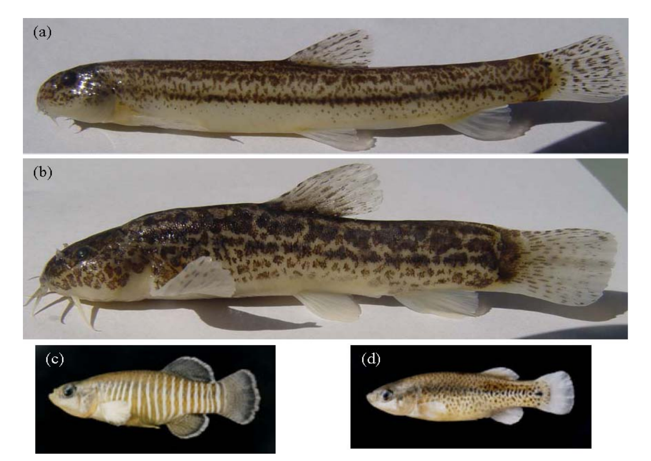
FIG. 3. - Three endemic fishes of Ghadamgah spring-stream system a, Cobitis linea (Cobitidae); b, Seminemacheilus tongiorgii (Balitoridae); c, male Aphanius sophiae ; d, female A. sophiae (Cyprinodontidae).