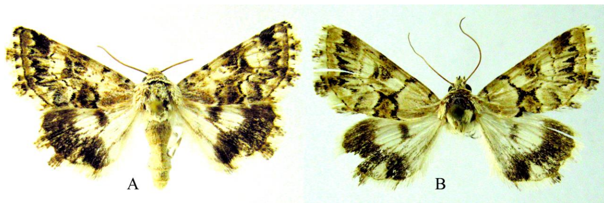
FIGURE 1. Armada nilotica adults. A. male, Iran, Kerman prov.; B. female, Iran, Kerman prov.

Distribution in Iran: Kerman (new record from Iran).