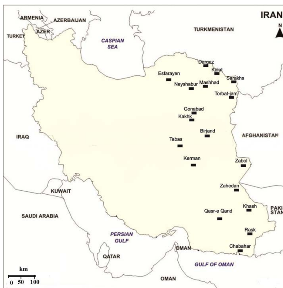
FIGURE 1. Map samples of M. musculus used in this study. Black boxes were referred to locality. Details of the samples are given in Table 1.