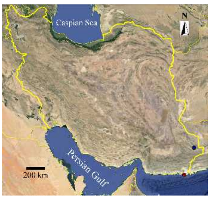
FIGURE 1. Map of Iran shows the new locality records for Ophiomorus brevipes (blue circle) and O. tridactylus (red circle) in Sistan and Baluchestan Province. Source of map from the Google earth (www.earth.google.com).

Because of the fossorial habits of Ophiomorus , its species have been collected and investigated less often than most other lizards in Iran. In spite of the relatively high species diversity of Ophiomorus (with emphasis on the endemic species), there are relatively limited published data about these scincids.