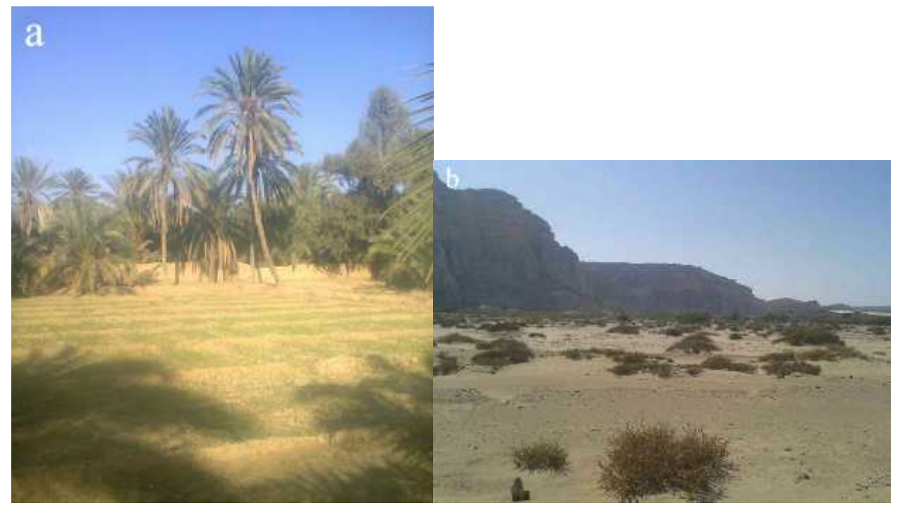
FIGURE 3. (a) Habitat of Ophiomorus brevipes in a palm grove in Sarjou, Saravan County, and (b) habitat of O. tridactylus in Beris-e Kohneh, Chabahar County, both in Sistan and Baluchestan Province.