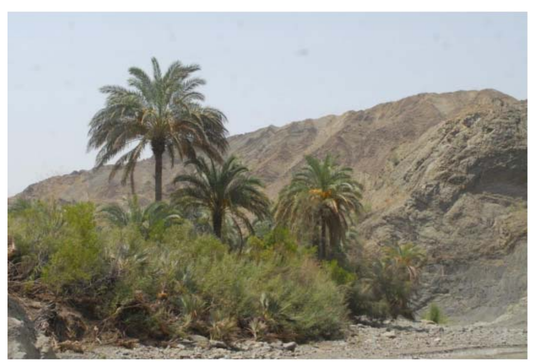
FIGURE 4. Habitat of Calotes versicolor in Kalesari village.

village is located 44 km far from the last record (Nahang River). Our record indicates a wider distribution for Calotes versicolor in southeast of Iran. Also some other localities in different parts of the area are documented. It seems that this lizard has a broad distribution in different locations.