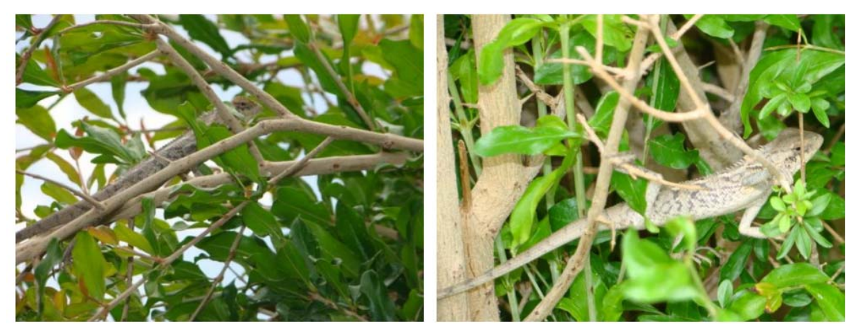
FIGURE 2. Adult female of Calotes versicolor in Kalagan village on Pomegranate, Sistan and Baluchestan province, Iran.