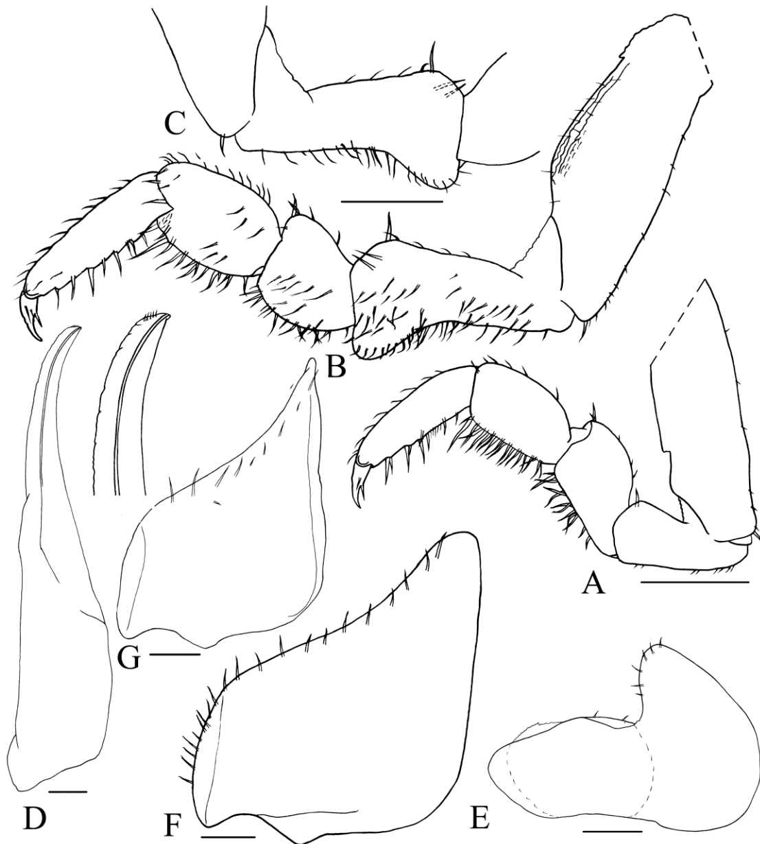
FIGURE 3. Schizidium golovatchi , male. A, pereopod I; B, pereopod VII, rostral view; C, pereopod VII ischium, caudal view; D, pleopod endopodite I; E, pleopod exopodite I; F, pleopod exopodite IV; G, pleopod exopodite V. Scales: A-C, 0.2 mm; D-G, 0.1 mm.