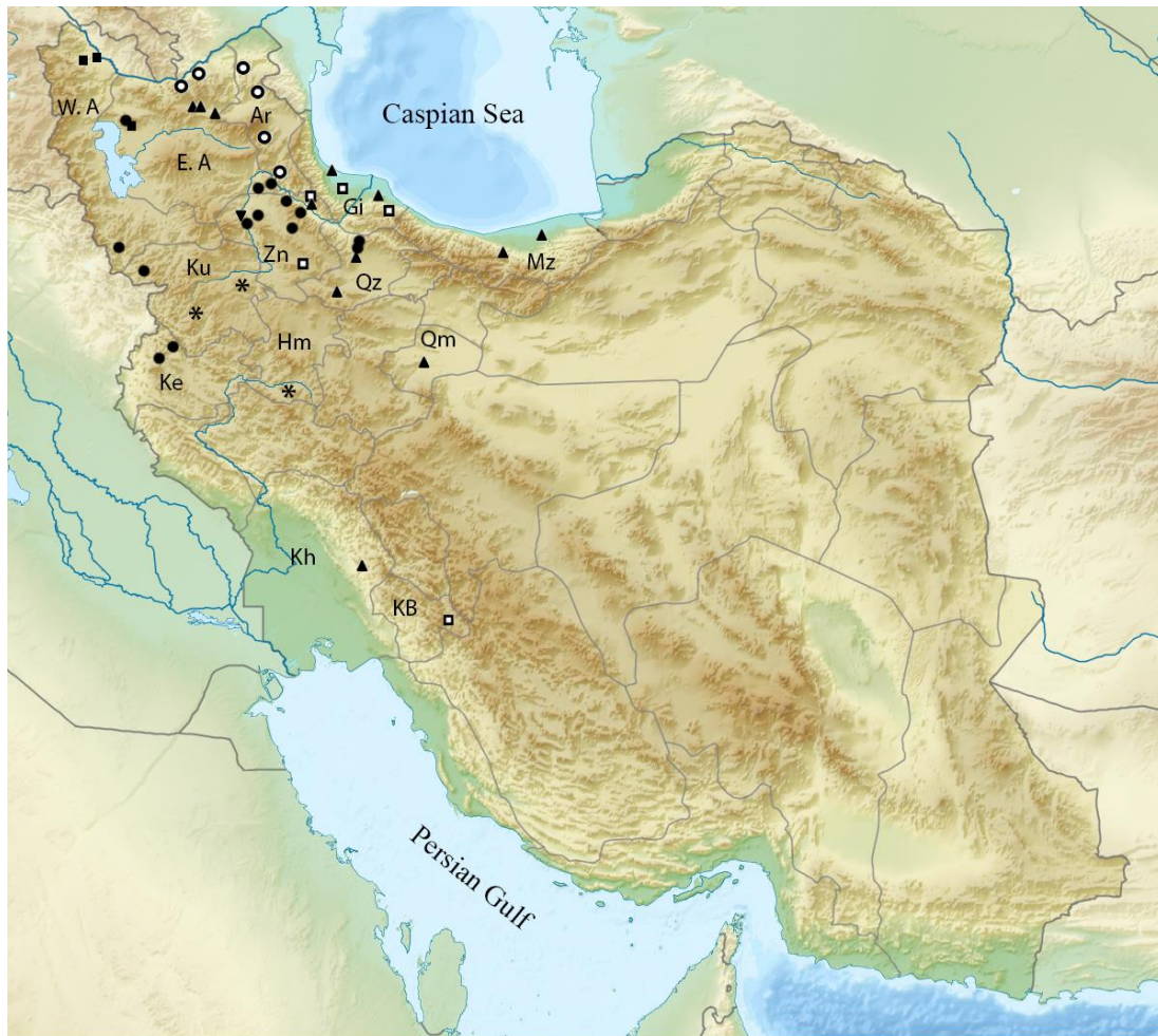
FIGURE 1. Map of Iran; indicating the sampling localities of Platyarthrus schoblii (▲), Trichorhina tomentosa (▼), Armadillo alievi (■), A. officinalis (*), Armadillidium azerbaijani (●), A. nasatum (◻) and Schizidium golovatchi (•). Ar: Ardabil; E. A: Eastern Azarbaijan; Gi: Guilan; Hm: Hamedan; K.B: Kohgilouyeh-Boyerahmad; Ke: Kermanshah; Kh: Khuzestan; Ku: Kurdistan; Mz: Mazandaran; Qm: Qom; Qz: Qazvin; W.A: Western Azarbaijan; Zn: Zanzan.