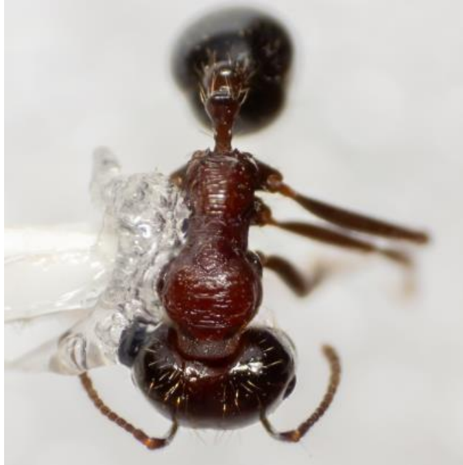
FIGURE 4. Messor laboriosus Santschi, 1927: alitrunk on the top.