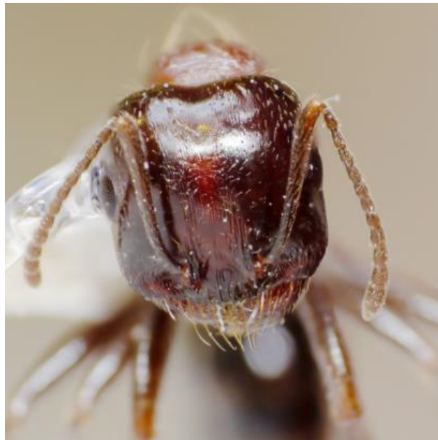
FIGURE 3. Messor laboriosus Santschi, 1927: face, dorsal view.