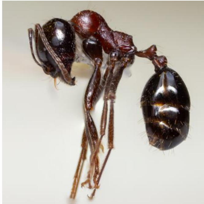
FIGURE 2. Messor laboriosus Santschi, 1927: lateral view of the body, worker

Distribution: Austria, Bulgaria, Czech Republic, France (type locality), Hungary, Romania, Slovenia ( https://www.antwiki.org ).