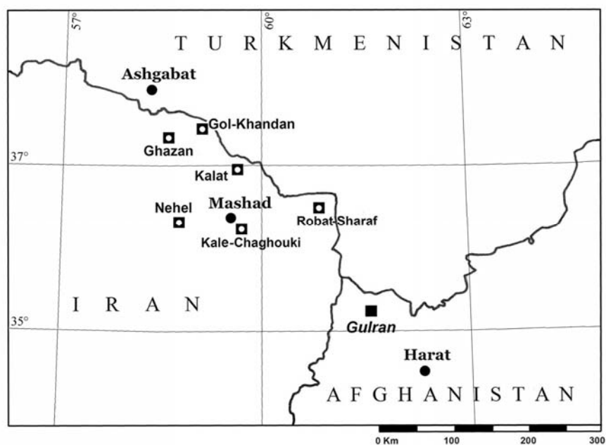
FIG. 1. – Sampling localities of Blanfordimys afghanus in Iran (◻); and the type locality of the species in Afghanistan (◼).

province (37° 19' 16" N, 58° 44' 41" E; 15 specimens, of which only eight were adult) and elevations (altitude: 2400m) of Nehel of Zoshk on the Binaloud Mountains (36° 16' 05" N, 59° 07' 49" E; one adult specimen) (Fig. 1). Identification was carried out by dental and cranial characters. Standard voucher specimens (skins, skulls) were deposited in the Zoology Museum of Ferdowsi University of Mashhad, Iran (ZMF).