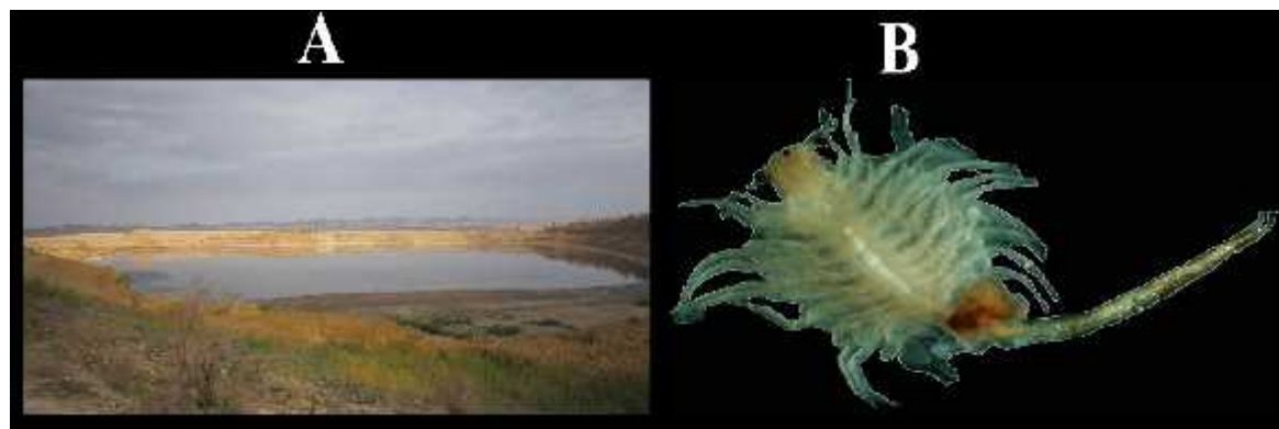
FIGURE 2. A. Current status of Bazangan Lake B. Female Artemia of Bazangan Lake.