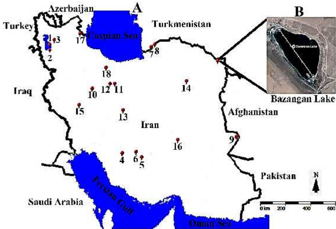
FIGURE 1. A. Distribution of Artemia in Iran. The Numbers indicate the Artemia Habitats. 1. Urmia Lake; 2. Lagoons West Azerbaijan; 3. Lagoons East Azerbaijan; 4. Maharlu Lake; 5. Bakhtegan Lake; 6. Tashk Lake; 7. Incheh Lake; 8. Shor Lake; 9. Varmal catchment; 10. Mighan Lake; 11. Qom Salt Lake; 12. Houze Sultan Lake; 13. Gaav Khooni Lake; 14. Kale Shoor-Gonabad; 15. Kale Shoor-Khorram Abad; 16. Nough catchment Kerman; 17. Shurabil Lake; 18. Kale Shoor Hashtgerd (Fig. from Agh 2006). B. Satellite view of Bazangan Lake.

and total salinity with ATAGO salinometer. Adult animals were preserved in 96% Ethanol and harvested cysts were frozen in -20^{\circ}\text{C} for future studies. In this annual monitoring on Bazangan wetland the following physico-chemical factors were recorded: total area: 300,000\text{ m}^2 (30 hectare), \text{pH} : 7.6, EC to >20\text{ mS/cm} , salinity 210 ppt, temperature 15^{\circ}\text{C} .