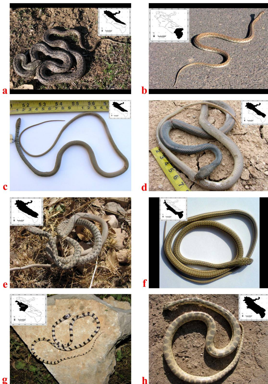
FIG.3.- Photographs and distribution maps of the species in Ilam Province: (a) Malpolon insignitus . (b) Malpolon moilensis , (c) Platyceps najadum najadum , (d) Platyceps rhodorachis rhodorachis , (e) Platyceps rhodorachis ladacensis , (f) Psammophis schokari , (g) Pseudocyclophis persicus , (h) Spalerosophis diadema cliffordi .