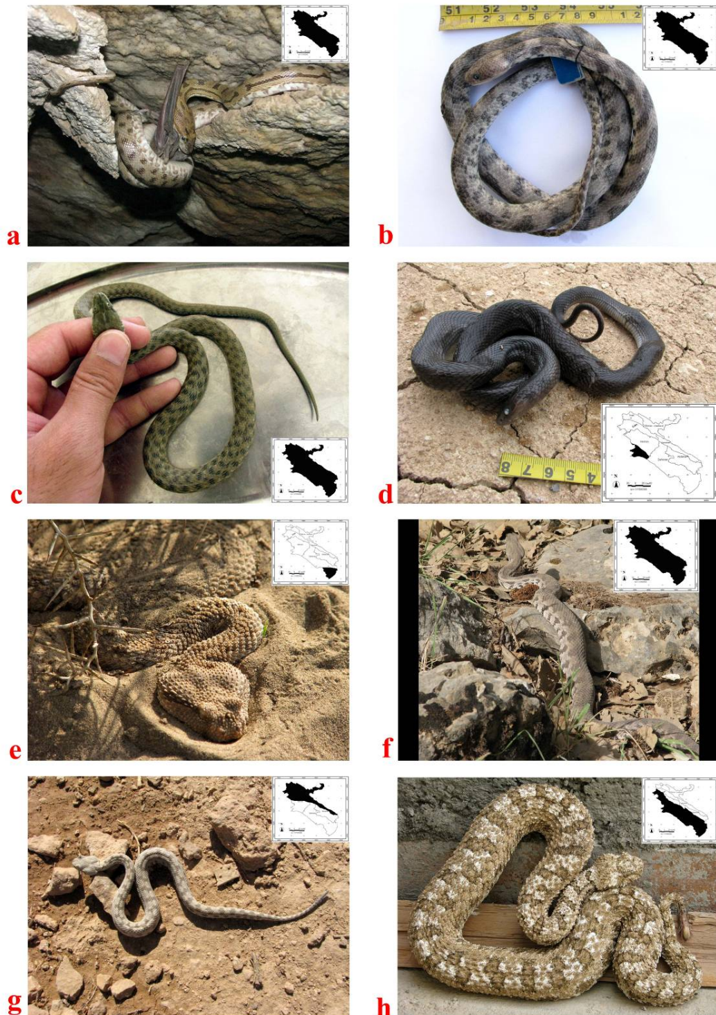
FIG. 4.- Photographs and distribution maps of the species in Ilam Province: (a) Spalerosophis microlepis capturing a bat, (b) Telescopus tessellatus martini , (c) Natrrix tessellata , (d) Walterinnesia morgani , (e) Cerastes g. gasperettii in ambush site, (f) Macrovipera l. Obtusa , (g) Pseudocerastes persicus , (h) Pseudocerastes urarachnoides .