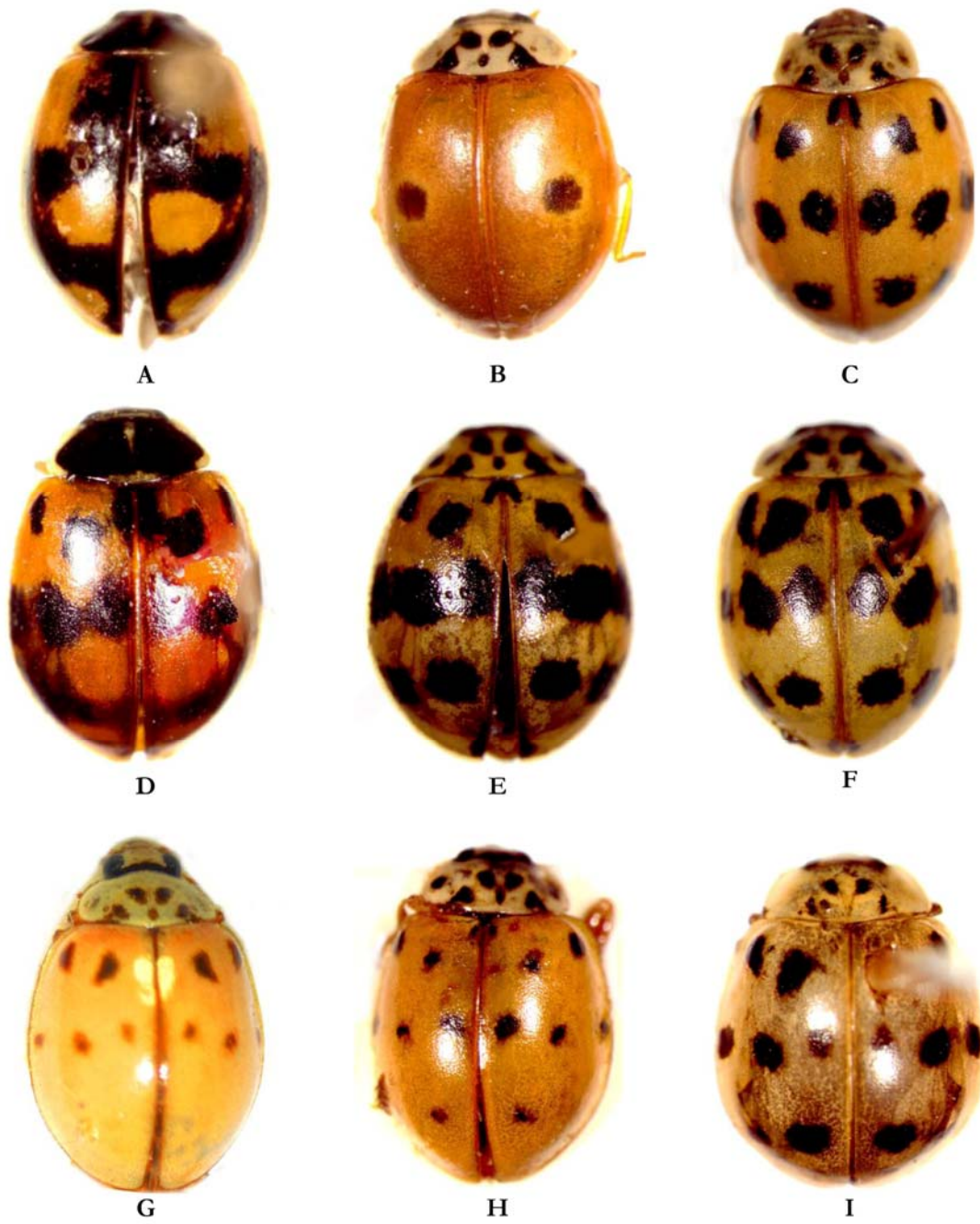
FIGURE 1. A-I) Outline and colour pattern: A-F) Adalia bipunctata , G-I. Adalia decempunctata