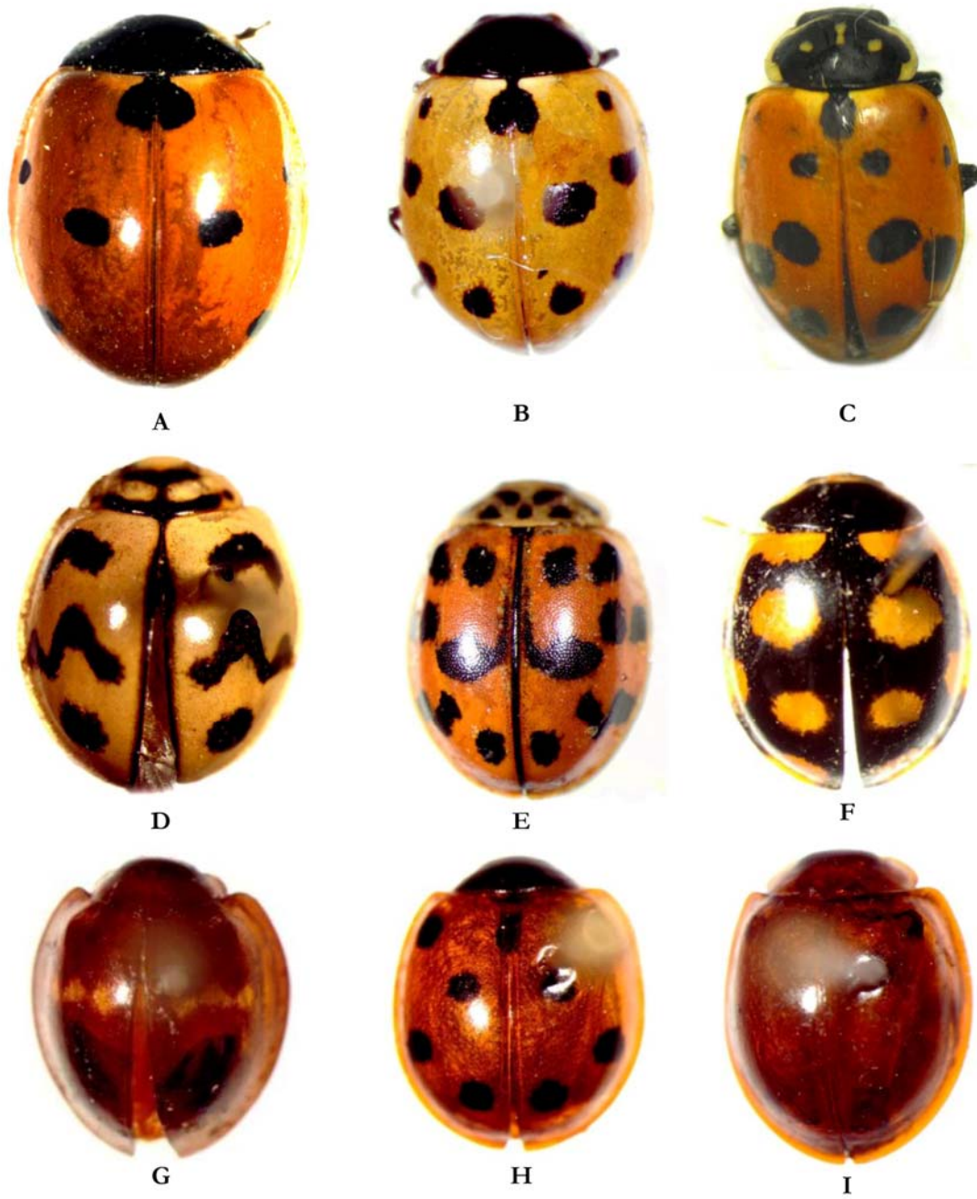
FIGURE 2. A-I) Outline and colour pattern: A) Coccinella septempunctata , B) Coccinella undecimpunctata , C) Hippodamia variegata , D) Menochilus sexmaculatus , E) Oenopia conglobata , F) Oenopia oncina , G) Chilocorus bipustulatus , H) Exochomus octosignatus , I) Exochomus quadripustulatus .