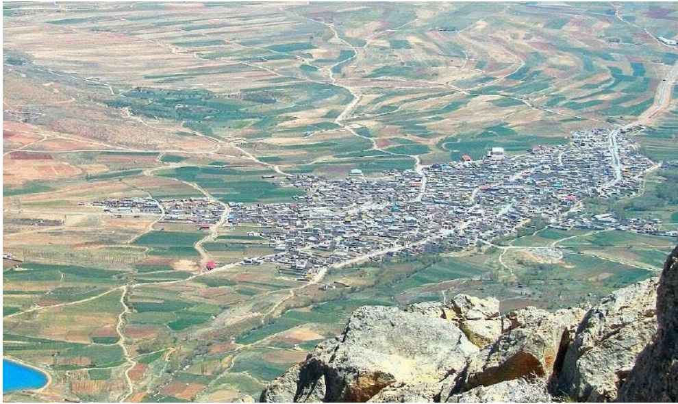
FIGURE 3. The location of Afus in the west of Isfahan province.