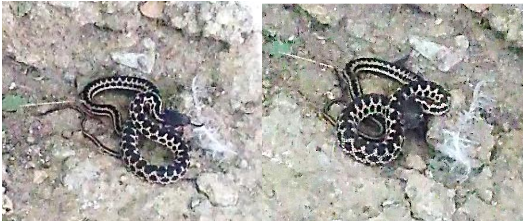
FIGURE 4. (Left & Right) Dorsal view of Platyceps ventromaculatus .