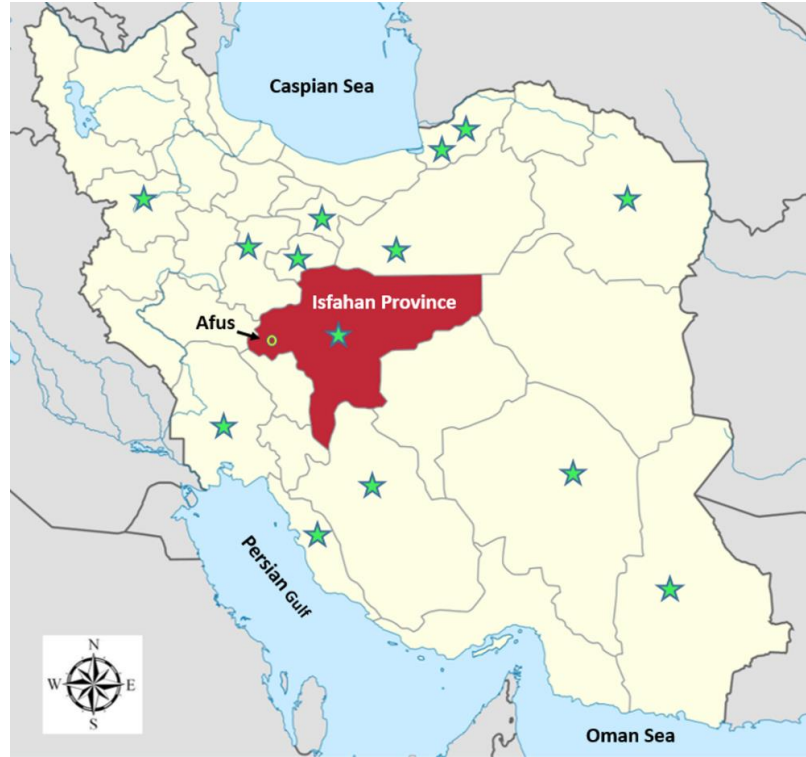
FIGURE 1. Location of Isfahan Province and Afus in this province in the central of Iran.