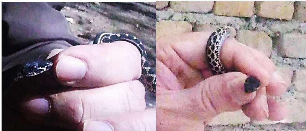
FIGURE 5. (Left) Lateral and (Right) dorsal view of Platyceps ventromaculatus head.