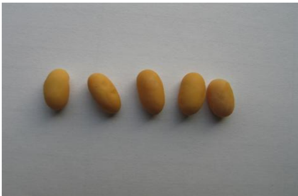
FIG. 4.- The eggs of Eremias trauchi trauchi .