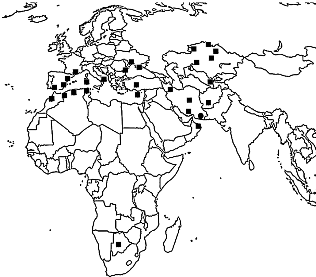
FIGURE 2. World distribution of Phallocryptus spinosa . ■previous world records, ●locality in current study