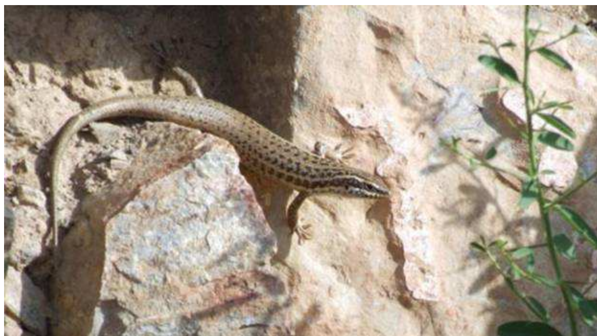
FIGURE 3. Trachylepis aurata transcaucasica (Chernov, 1926).

Euprepis affinis De Filippi, 1863;25 (not Tiliqua affinis Gray, 1838)