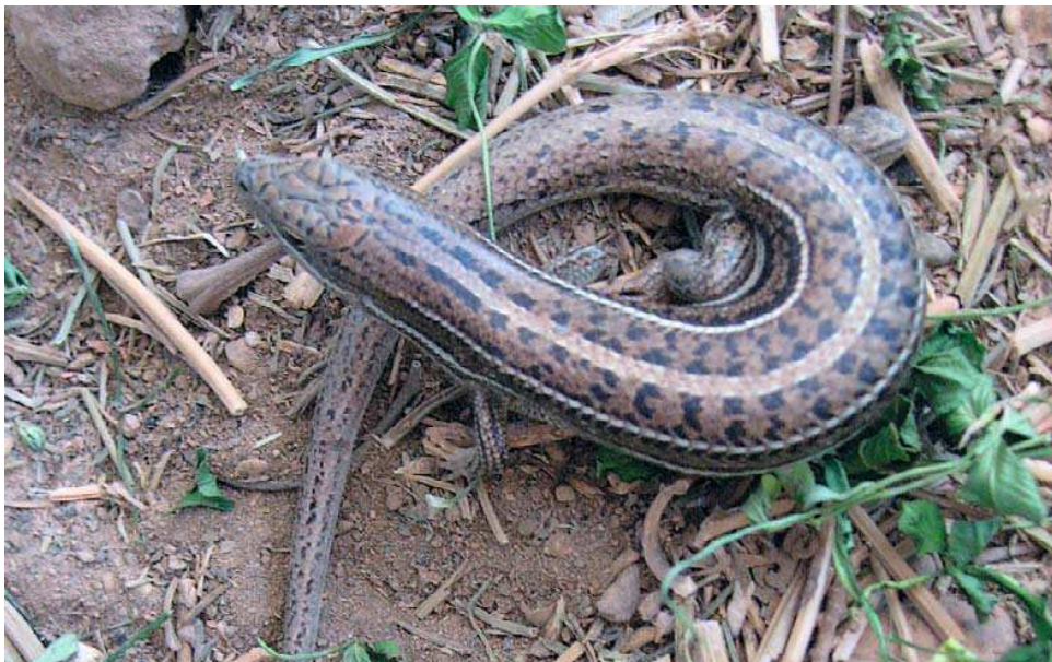
FIGURE 5. Trachylepis vittata from western Iran (Sarpol-e zahab western Kermanshah).

Euprepes vittatus - Peters 1864, Peters 1867: 20, Peterris 1874: 372, Peterris 1878: 204, Boettger 1880: 187, Peters 1882: 70, Böttger, 1885.