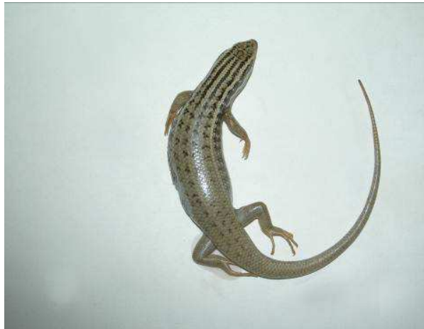
FIGURE 4. Trachylepis septemtaeniata , collected from Firouz Abad (Fars province).