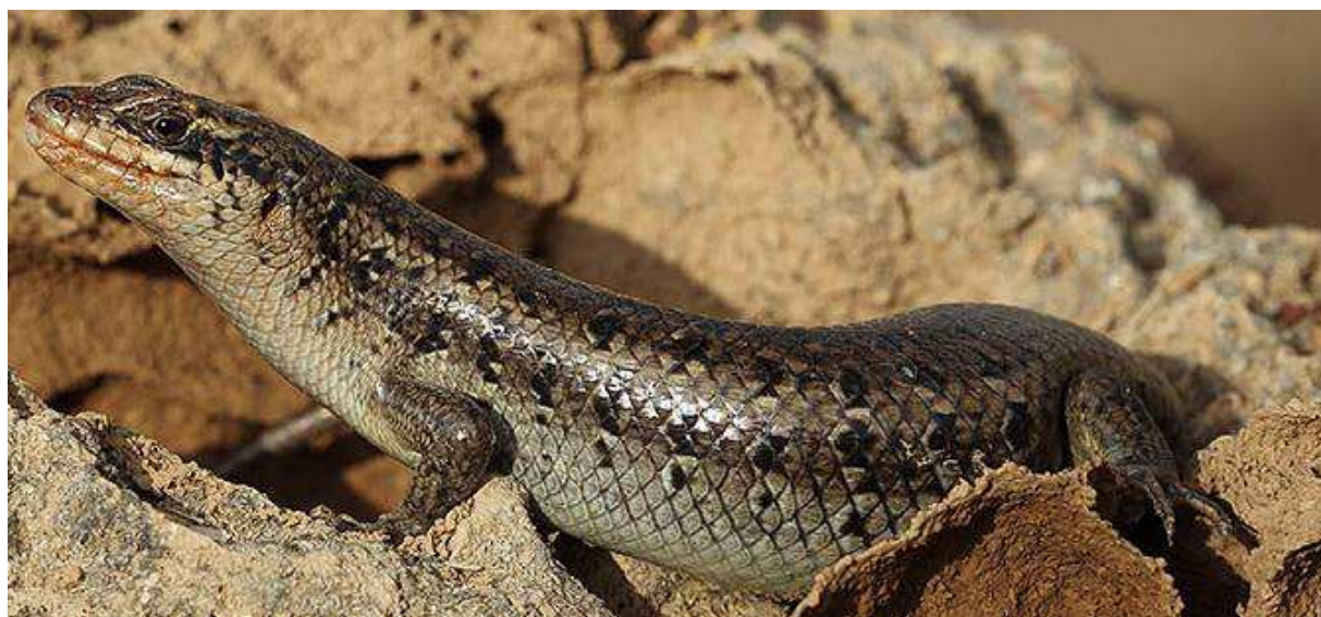
FIGURE 6. Trachylepis brevicollis Ayn Hamran, Oman