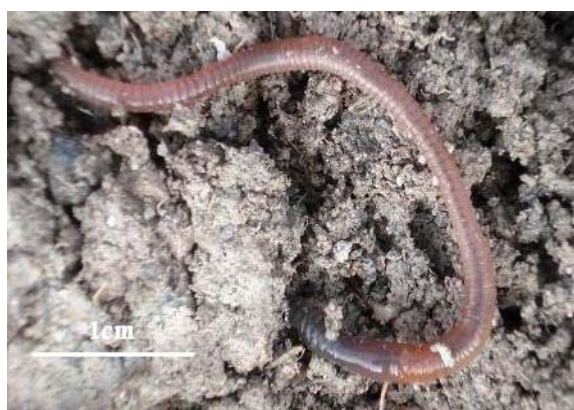
FIGURE 8. Eiseniella tetraedra .

Collecting sites: Bagher Shahr (N 35° 31' 46.6"; E 51° 44' 50.9").