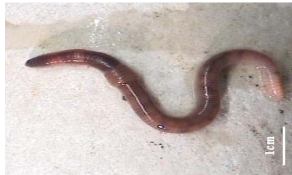
FIGURE 7. Eisenia fetida .