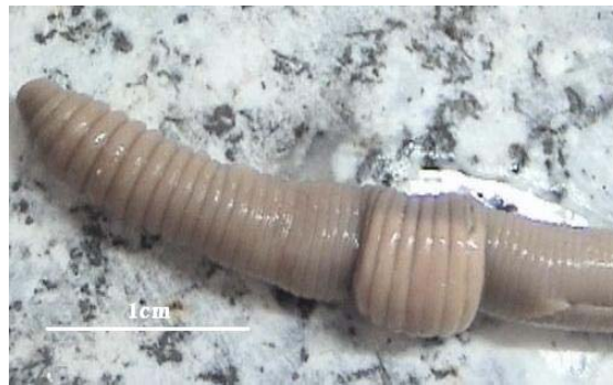
FIGURE 10. Perelia kaznakovi .