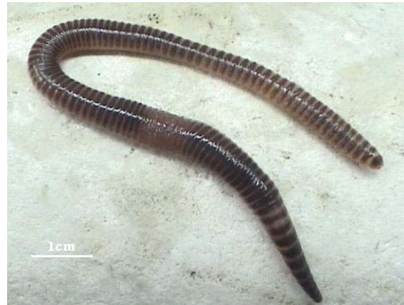
FIGURE 5. Dendrobaena veneta .