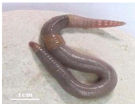
FIGURE 9. Octolasion lacteum .