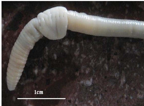
FIGURE 4. Aporectodea rosea .