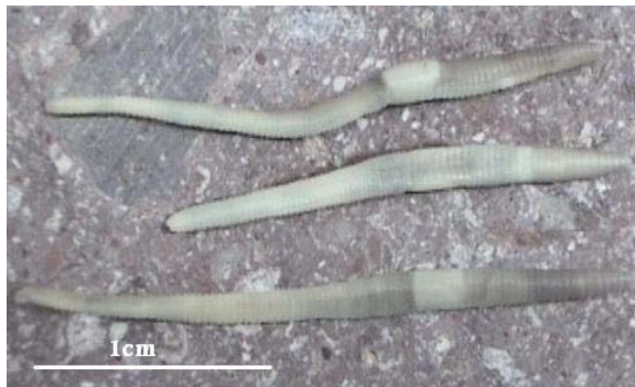
FIGURE 6. Dendrodrilus rubidus .