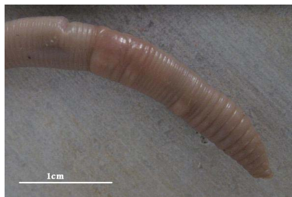
FIGURE 2. Aporrectodea caliginosa caliginosa .

Collecting sites: Touchal (N 35° 49' 18"; E 51° 24' 05").