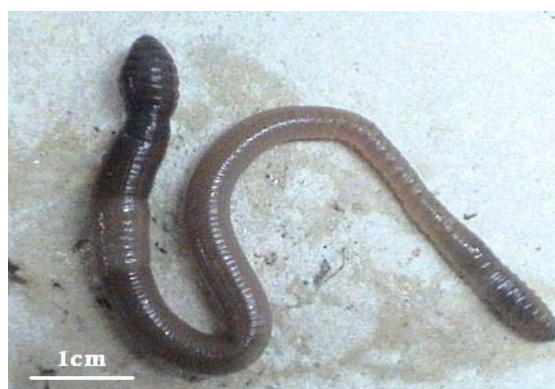
FIGURE 3. Aporrectodea caliginosa trapezoides .