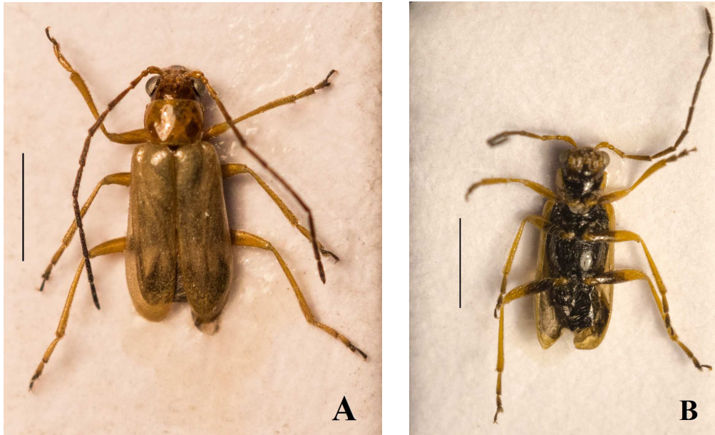
FIGURE 2. Dorsal (A) and ventral (B) view of Luperus perlucidus Iablokoff-Khinzorian, 1956.