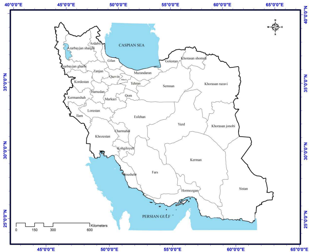
FIGURE 1. The administrative provinces of Iran