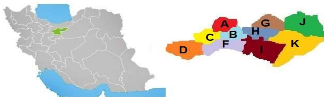
FIGURE 1. Collecting sites of Mantodea: Tehran province (green color) within Iran (Left); the districts (Right) (for localities and details see Table 1).