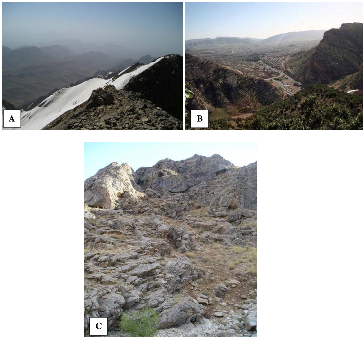
FIGURE 3. Habitats of collected specimens. A: Iranolacerta zagrosica in ery cold environment in top of Kaljonun mountain peak. B: Apathya cappadocica urmiana in oak forest habitat in Manesht va Ghalarang protected area. C: Apathya yassujica in sparsly vegetated habitat in Pire Ghar mountain side.

The Afous area is on the northern slope of the type locality with ecological factors similar to the type locality. The new specimens from Lorestan Province inhabited sharp vertical rocky slopes at 3100-3900 m altitude at Kaljonun mountain Peak, a remote and harsh habitat far from public access (Fig. 3). The specimens were observed on vertical stony slopes and in crevices. In June some adults were observed performing courtship displays. The population at the mountain peak was of high density. The specimens emerged from crevices in rocks and were easily captured. Laudakia caucasia was the only sympatric species observed in the habitat. In Kuhrang region, specimens were collected on stonewalls made by nomads on the mountainsides. Astragalus sp. was the predominant vegetation, and the area was overgrazed.