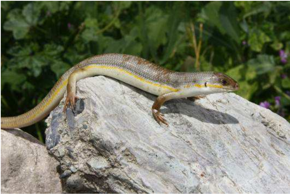
FIGURE 2. Eumeces schneiderii princeps from Markazi Province.