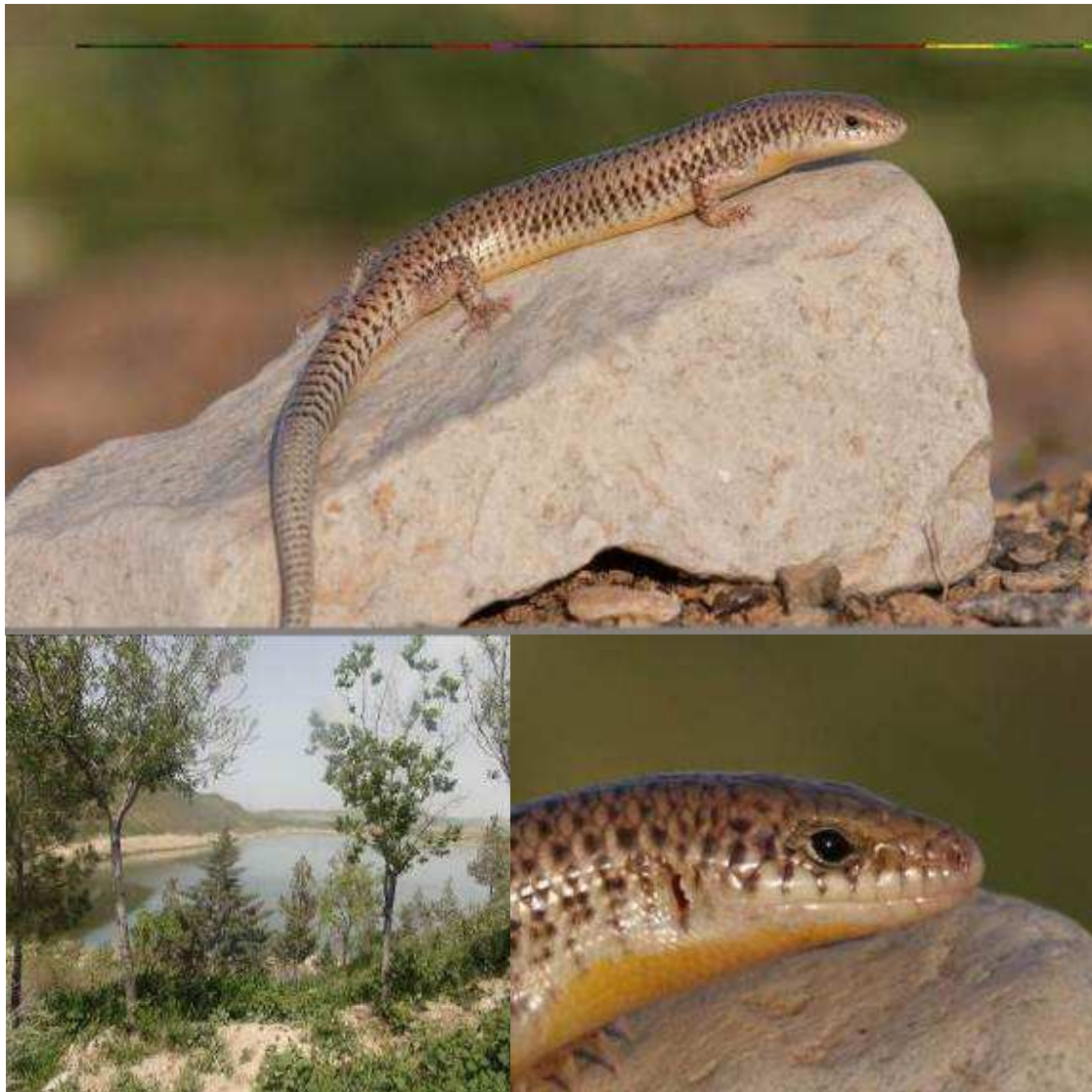
FIGURE 4. Eurylepis taeniolatus around Bezangan Lake, Razavi Khorasan

both species ( scutatus and taeniolatus ) as belonging to the same species, and put both as taeniolatus Blyth 1854. And Scutatus Theobald's became synonymous with taeniolatus Blyth (Taylor 1935).