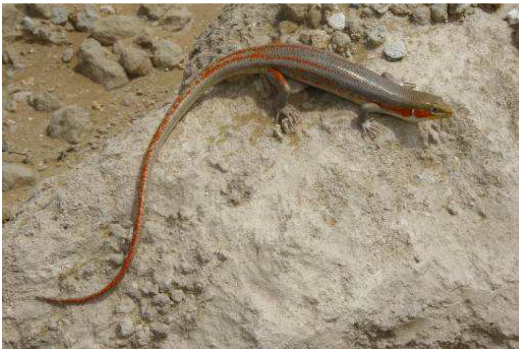
FIGURE 3. Eumeces schneiderii zarudnyi , from Qeshm Island, Hormozgan Province, southern Iran (Photo by: Fariborz Heidari).