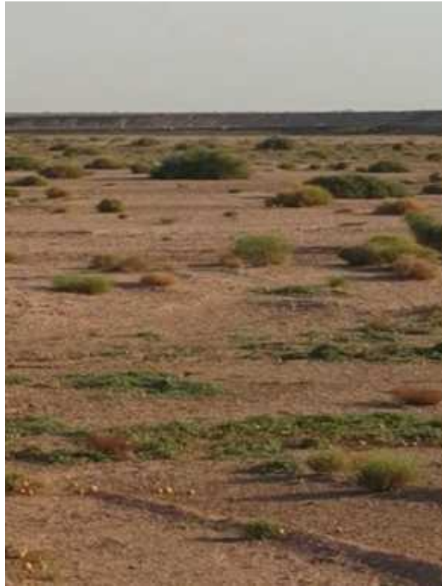
FIGURE 3. The habitat of Rhino Gecko misonnei .