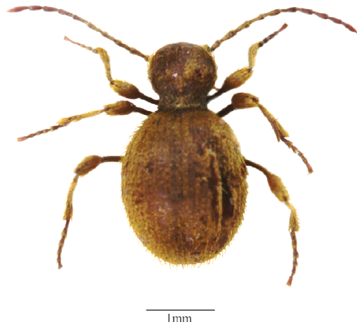
FIGURE 2. The species Niptus hololeucus , new record for Iran (dorsal view).